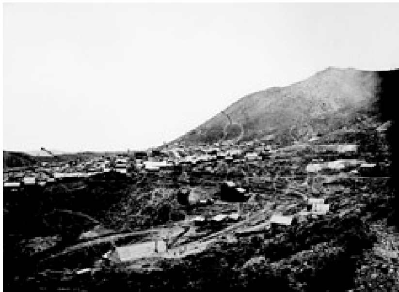
Virginia City 1867-7.