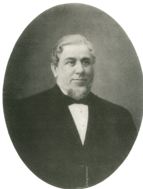
John James Hughes (1814 – 1889)